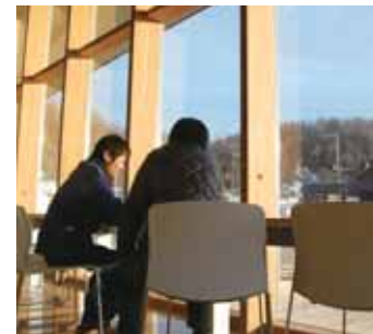
Rest area where visitors can relax while reading books related to Shiretoko

Structure: one-story wooden building Floor area: 758m 2 Exhibition room/lecture room/meeting room/office/Ranger Office for Nature Conservation, Ministry of the Environment