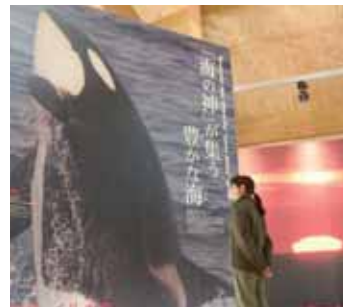
Life-size photo panel of animals