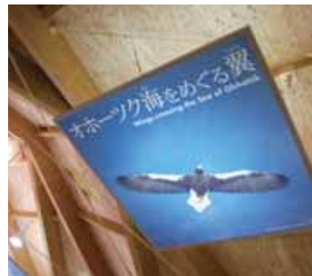
Space where the warmth of wood can be felt

The Shiretoko World Heritage Conservation Center displays life-size photos of brown bears, yezo deer and other animals living in Shiretoko, and models of claw marks of brown bears and other traces left by animals. It also showcases the magnificence of Shiretoko's nature and gives rules that must be observed by visitors. It provides real-time information on the sights and nature of the Shiretoko World Heritage site and the latest information on the management of the site.