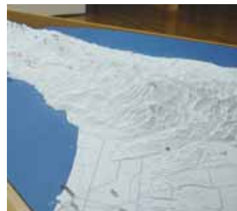
The 1:25,000 topographic model presents the sights of Shiretoko