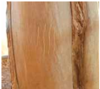
Model of traces left by animals (claw marks of brown bears, etc.)