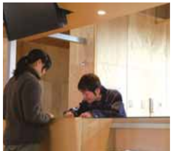
Information counter with seasonal information on nature